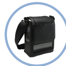
Inogen One G5 Carry Bag* Item #CA-500