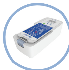
Inogen One ® G5 Extended Life Lithium Ion Battery** Up to 13 hours run time Item #BA-516