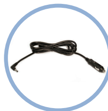
Inogen One G5 DC Power Cable* Item #BA-306