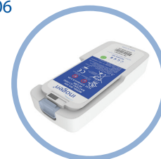
Inogen One G5 Lithium Ion Battery* Up to 6.5 hours run time Item #BA-500